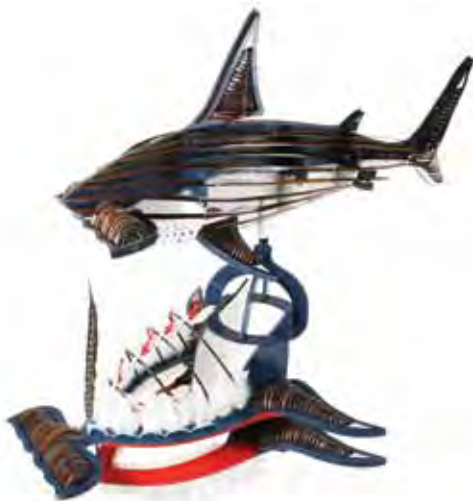
KEN THAIDAY SNR Black Bamboo Hammerhead Shark Headdress , 2009. Acrylic paint, marine plywood, black bamboo, feathers, plastic, glass, nylon line and metal fittings. 112 cm x 110 cm x 80 cm. Artwork and photograph courtesy the artist and The Australian Art Network, Sydney and Cairns.