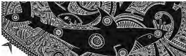
BRIAN ROBINSON Baidam Thithuyil (Shark Constellation) (detail), 2009. Linocut printed in black ink from one block, 300 mm x 497 mm.

KickArts Contemporary Arts is open Tuesdays to Saturdays, 10 am – 5 pm and will be open Sunday 22 August 10 am – 3 pm.