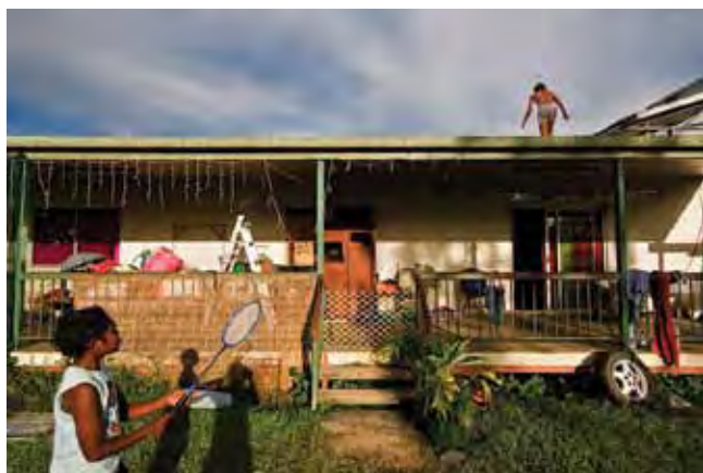
TAMMY LAW Backyard Badminton , 2009. Photograph.

Find Cell Art Space on the map on pp 72–73.