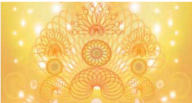
IAN JENSEN , Creation (detail), 2010. Digital work.