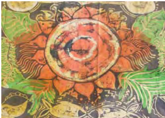
LIZ SAVEKA, Sun & Shells (detail), 2010. Batik.

Shuttle bus stop 9. See pp 74–77 for timetable.