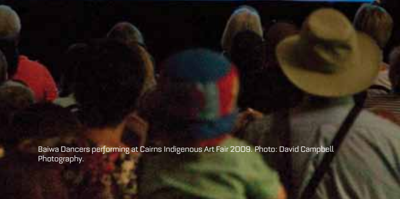
Baiwa Dancers performing at Cairns Indigenous Art Fair 2009.