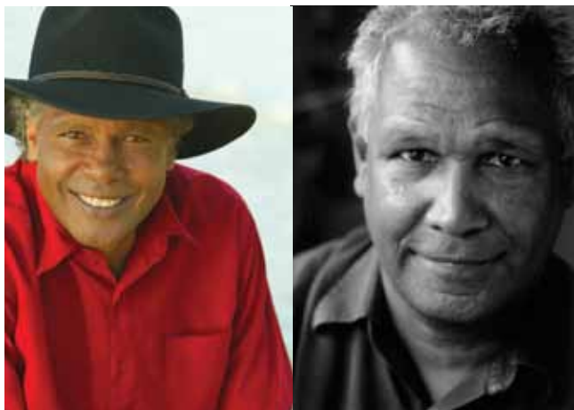
Left: Ernie Dingo.