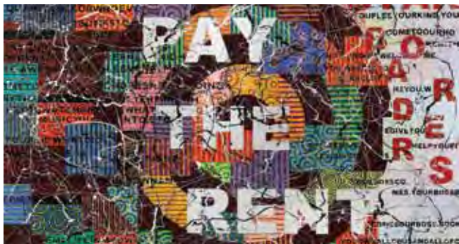
RICHARD BELL Pay the Rent (detail), 2009. Acrylic on canvas, 243.84 cm x 365.76 cm. Artwork and photograph courtesy the artist and Milani Gallery.