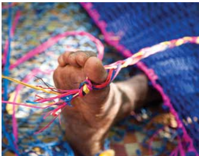
Ghost net weavers, Cairns Indigenous Art Fair 2009.